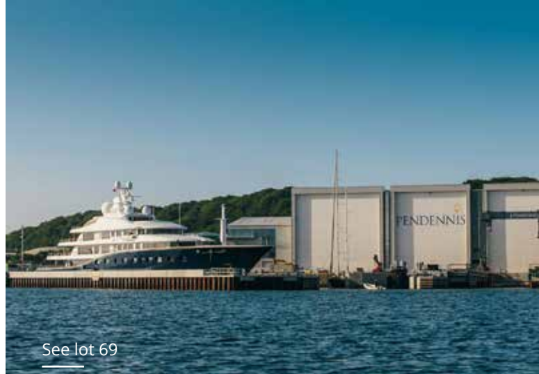
See lot 69

A 2-day First Aid course run by Phoenix Project 2020. These courses, which are held every 2 weeks at different locations in Cornwall often have Sepsis awareness input from Melissa Mead of The Sepsis Trust. A must