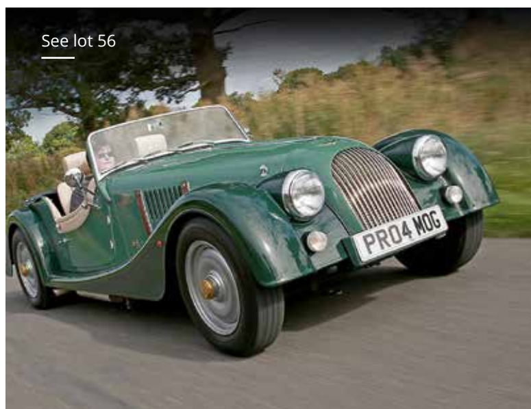
See lot 56

Dinner, bed and breakfast for two people in the Greenbank Hotel, Falmouth. Come and stay the night in our best available room and enjoy our contemporary, harbourside hospitality.